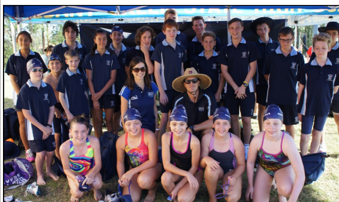
District Swimming Carnival 17 February